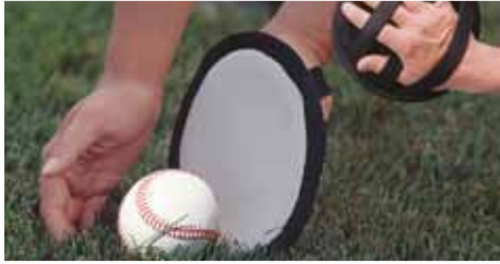
TRGX Retail Packaged