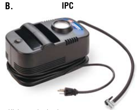
High speed school pump inflates basketball in seconds.