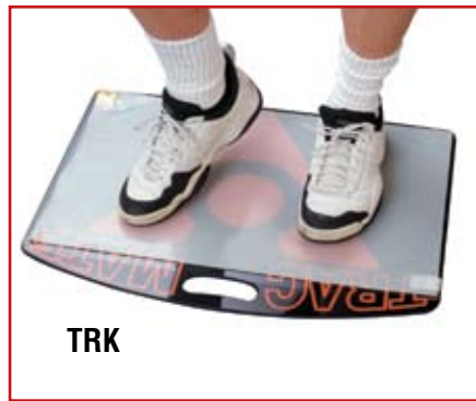
Slipp-Nott™ Shoe Clean System