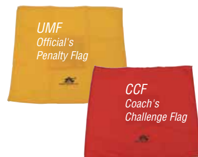
UMF Official's Penalty Flag