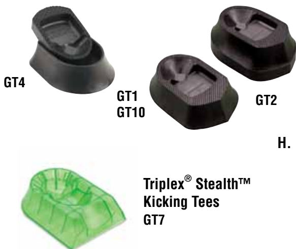
Triplex® Stealth™ Kicking Tees GT7