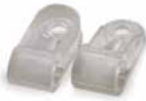
CRS Youth Mask CAG Adult Mask