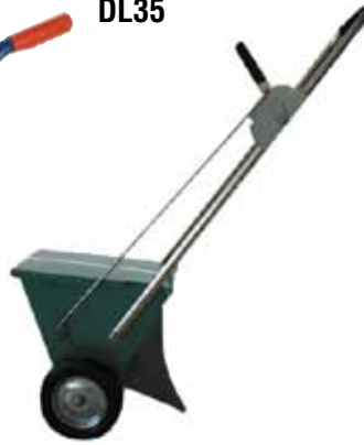
I. 35 lb. Capacity Liner DL35