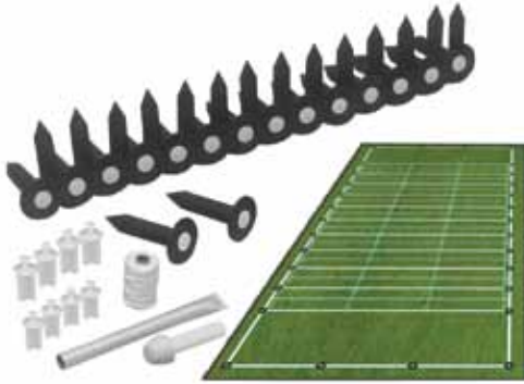
A. Field Lining Set FMS