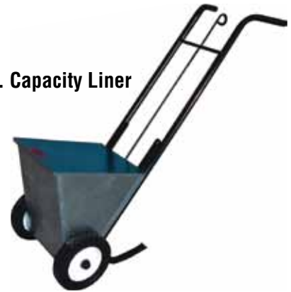
F. 50 lb. Capacity Liner 2L50