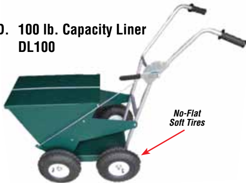
D. 100 lb. Capacity Liner DL100