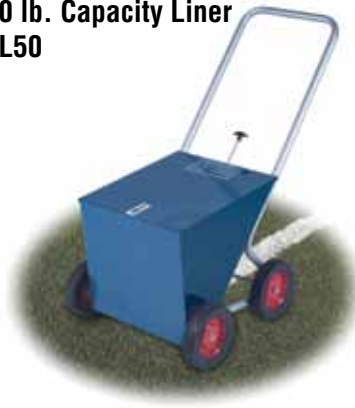
B. 50 lb. Capacity Liner FL50