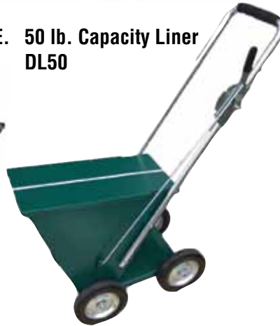
E. 50 lb. Capacity Liner DL50