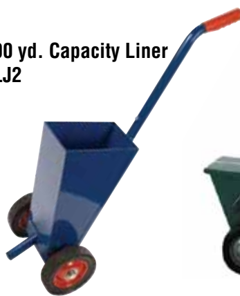
H. 200 yd. Capacity Liner FLJ2